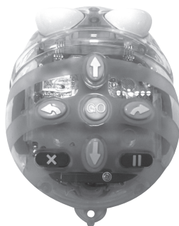
USB Charging Socket