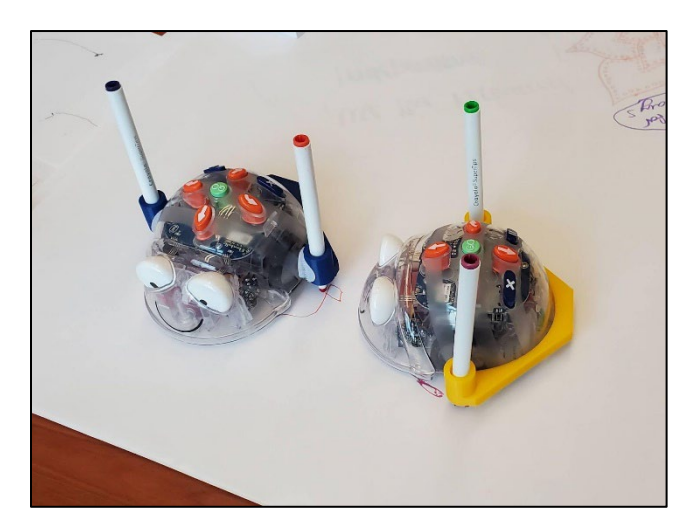
Figure 2. Bee-Bots with 3D printed attachment that holds two markers.